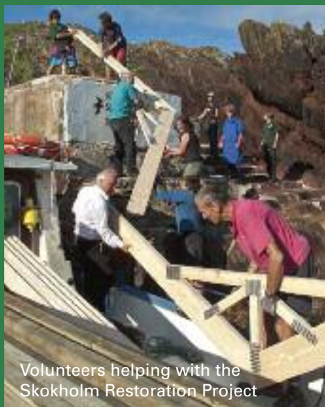
Volunteers helping with the Skokholm Restoration Project