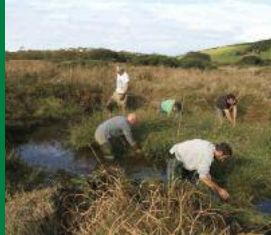
Pond clearance at Llangloffan Fen