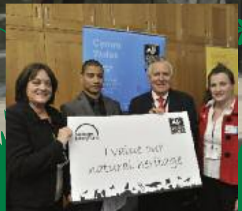
Westminster event to celebrate the partnership and achievement of Heritage Lottery Fund and The Wildlife Trusts