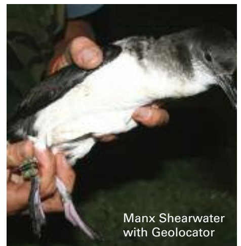
Manx Shearwater with Geocator