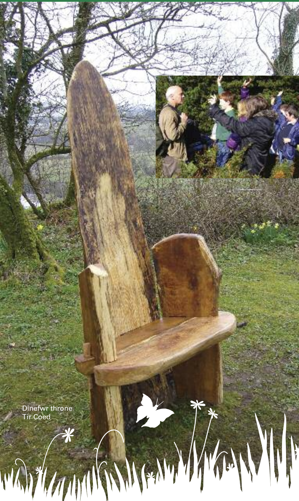
Dinefwr throne Tir Coed

Skokholm Island was closed to visitors in 2007 due to deterioration of the buildings. The initial idea of a complete overhaul along the lines of the Skomer renovation, would have cost over £1 million. However, plans could never be fully agreed and funding on this scale was unlikely to be achievable so soon after the large lottery grants awarded for the Skomer project, and in the face of deteriorating financial conditions countrywide. The solution was proposed by the Friends of Skokholm and Skomer Islands, and over the course of the year they worked closely with staff to renovate the farm complex using mostly volunteer labour and a much smaller budget. The renovations are likely to take 2-3 years in total, and as a direct consequence of this new approach, the renovation costs will have been reduced to under £100,000. This incredible achievement is testament to the unfailing energy and commitment shown by a dedicated group of volunteers. Over the course of this year, volunteers collectively put in around 2,200 hours of work on Skokholm alone.