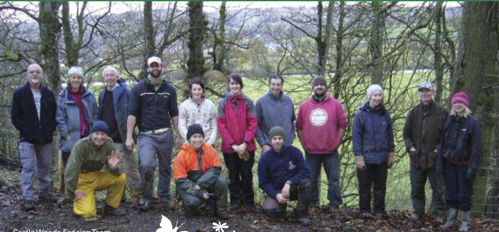
Castle Woods Fencing Team