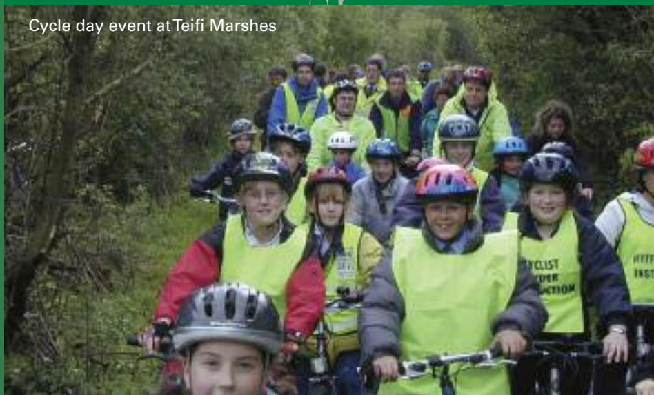
Cycle day event at Teifi Marshes