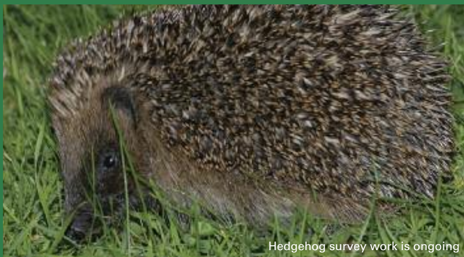
Hedgehog survey work is ongoing

We continued to work on assessing the impacts of the Tir Gofal agri-environment scheme