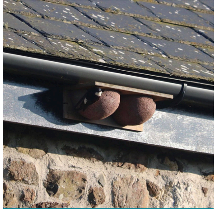
Meet the residents!