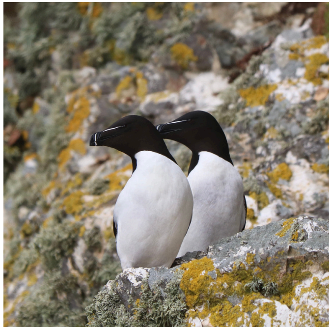
A pair of razorbills among lichen

Thank you again for supporting the Wildlife Trust of South and West Wales. We hope to see you again on our island home in the future.