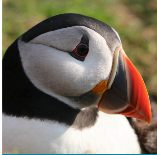
An ever-posing Atlantic Puffin