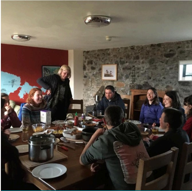
Plenty of room for everyone at dinner

Our spacious lounge doubles up as a dining room. Here you'll also find a comfortable sofa, and a log burner* - perfect to curl up in front of on a chilly evening!