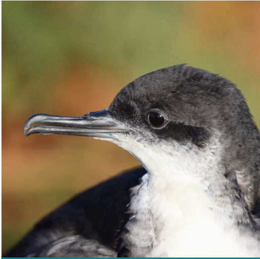
One of our elusive Manx Shearwaters

We ask all overnight guests and volunteers on Skomer and Skokholm to adhere to our biosecurity measures to help protect the islands from rats and other invasive species