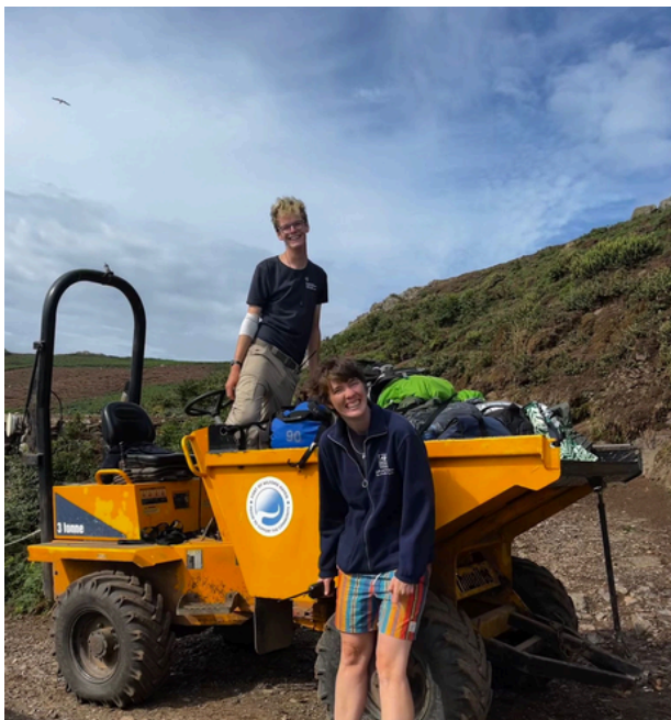
Packing the dumper for transport

As such, we're asking everyone to bring bags under 15kg as we've seen a big increase in recent years - many small and light ones are fine! If your bag is oversized, it will be left at the bottom for you to unpack to a suitable weight or carry yourself. We are legally bound to protect our staff, volunteers and visitors from injury and oversized bags can cause problems. Please note that where we have too many bags for the dumper, some may need to be carried.