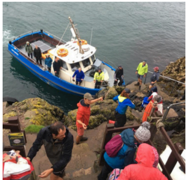
Forming a chain to move luggage

Your return journey to the mainland will usually leave Skomer around 9.30am.