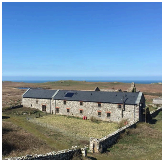
Our hostel accommodation

Up at the Farm, we unload your bags and get you settled in to the hostel. Once this is done, the island is yours to explore!