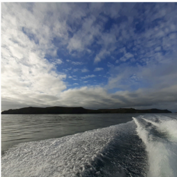
First glimpse of Skomer from the boat!