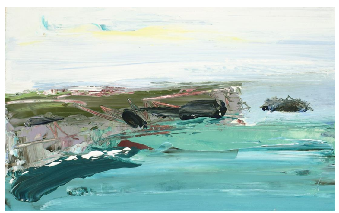
Windswept Cliff – mixed media painting by Linda Norris

There is a basic solar generated electricity supply with which it is possible to recharge mobile phones and laptops, it will not tolerate high voltage items like hairdriers!