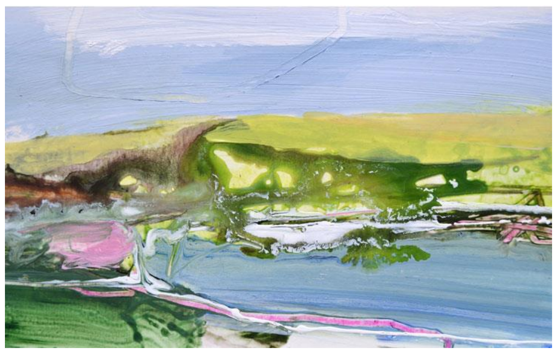
'Campion Fields' mixed media painting by Linda Norris

By late August the puffins and the other auks have left the island and the seals have begun to pup. By day the island is a quieter place offering a chance to enjoy absorb the peace and quiet and develop your understanding of the landscape in the company of the ravens, short-eared owls and chough. At night hundreds of thousands of Manx Shearwaters arrive in raucous fashion to feed their growing chicks which are living in burrows on the island.