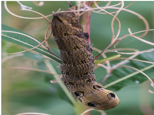
Elephant Hawkmoth Caterpillar

Foodplants for some of the UK moth caterpillar species include: