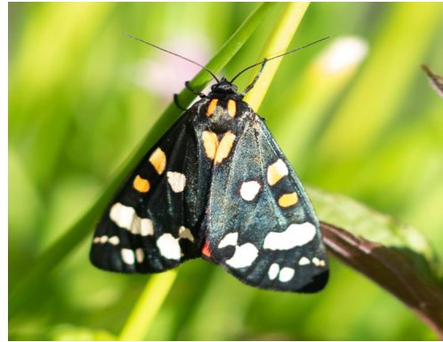
Scarlet Tiger Moth

Bedstraws, Cleavers for Hummingbird Hawkmoth